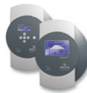
Solar-Log 500/1000™ Data logger