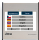
StecaGrid Monitor Data logger