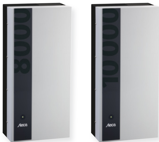
StecaGrid 8000 3ph

The combination of the StecaGrid 8000 3ph and the StecaGrid 10 000 3ph allows optimum design for almost any power class. A diverse range of combinations are possible but they all share the same goal: the effective use of solar irradiation.