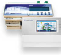
Meteocontrol WEB'log and Meteocontrol WEB'log Comfort Data logger