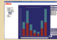
StecaGrid Connect User User software