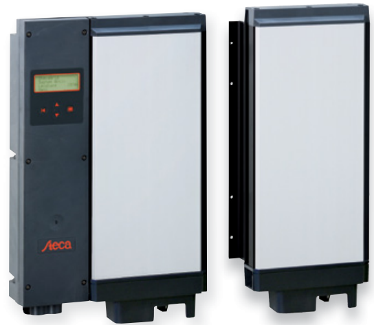
StecaGrid 2010+ Master not shown: StecaGrid 2000+ Master

To reduce the installation time, the StecaGrid 2010+ inverter has an integrated DC circuit breaker. For safety reasons, the cable cover located above the DC connector can only be removed when the DC circuit breaker is switched off.